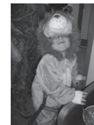
Benoit the Lion