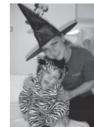
Matthew the Zebra with Tracy the Witch